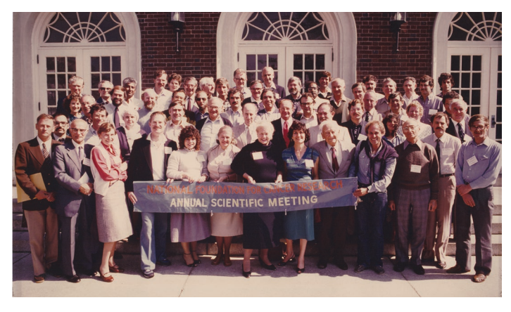
Scientists at the NFCR Annual Scientific Meeting in Woods Hole, Massachusetts in 1984.