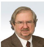
2014 - James P. Allison, Ph.D. Professor and Chair, Department of Immunology The University of Texas, MD Anderson Cancer Center, Houston