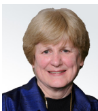
2016 - Mary-Claire King, Ph.D. Professor of Medicine (Medical Genetics) and Genome Sciences at University of Washington