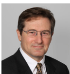
2017 - Michael N. Hall, Ph.D. Professor of Biochemistry Biozentrum of the University of Basel, Switzerland